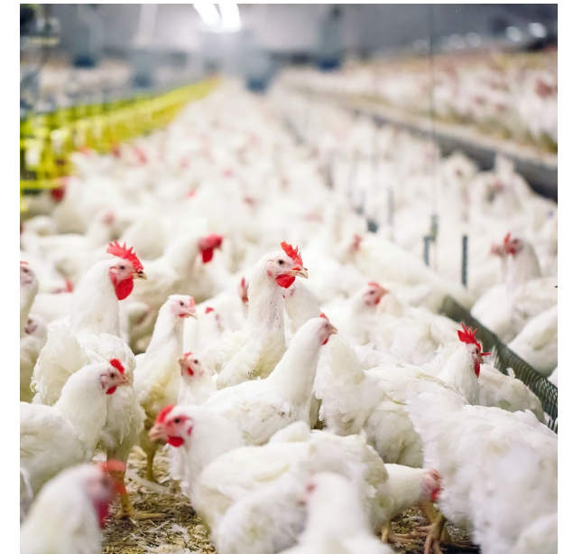
Image Sources: Shutterstock, used with permission Allyson Gemma, Asbury University Practicum Student, Catholic Charities of Louisville